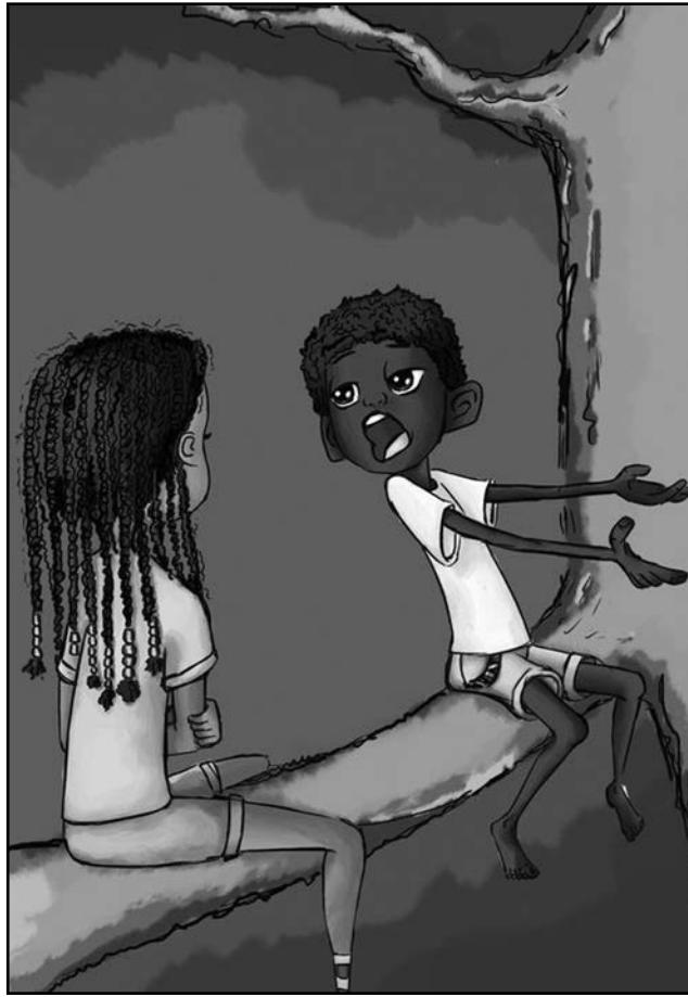
Used with permission.