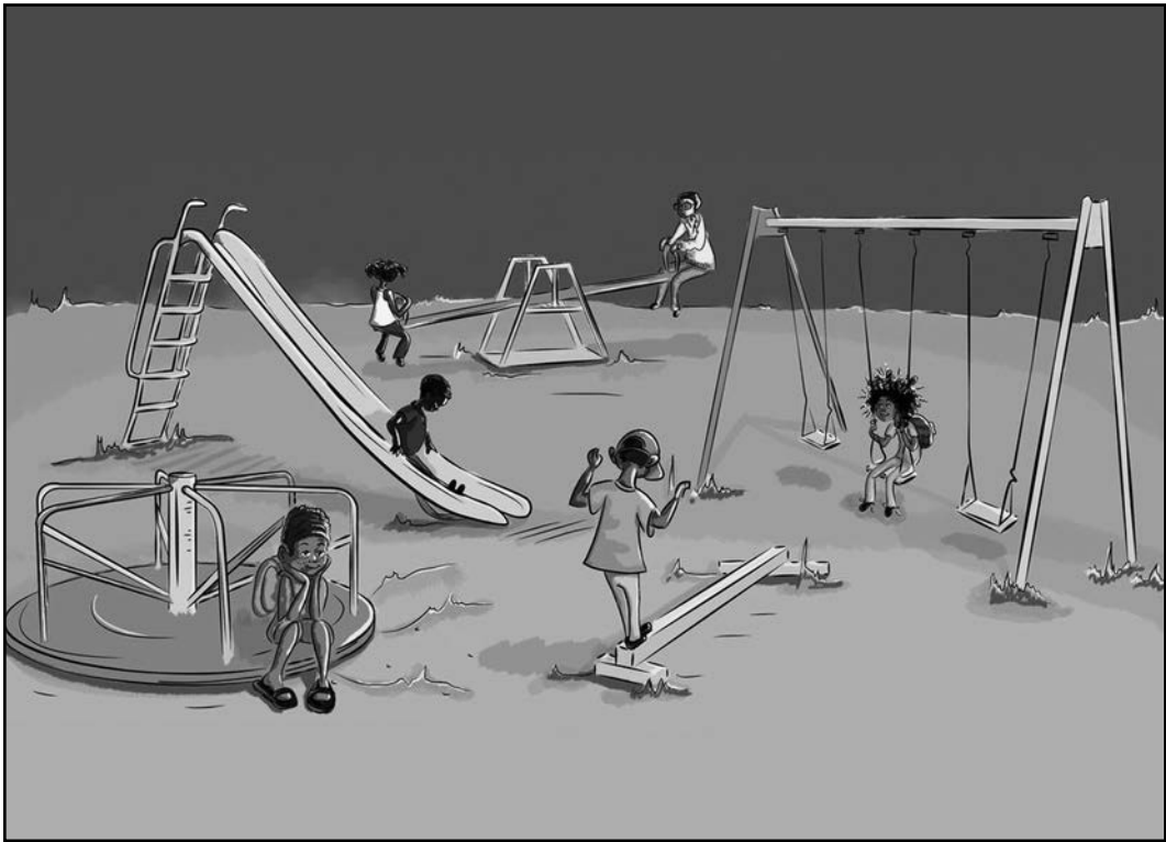
Used with permission.