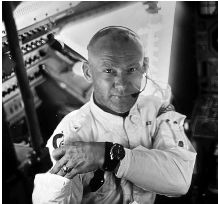
In the public domain.